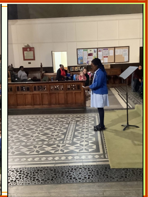
All information about our school can be found on www.st-johnjerusalem.hackney.sch.uk