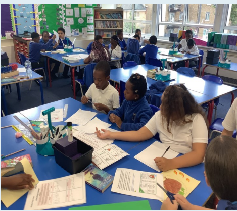
Working hard in class