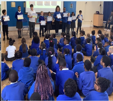
Taking part in Assemblies