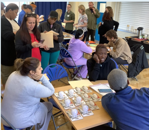
Hosting a Hackney Community Coffee Morning