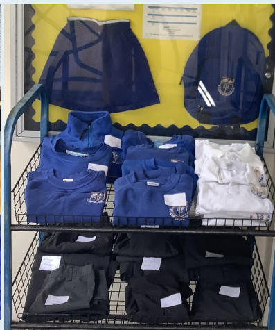
Starting our Pre-Loved Uniform Bank

All children must wear their full school uniform at all times: